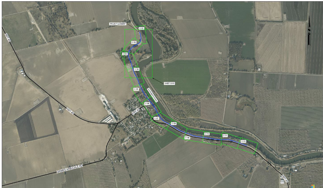
3) Approximate project footprint map