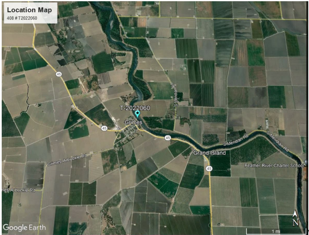
2) Proposed project location map